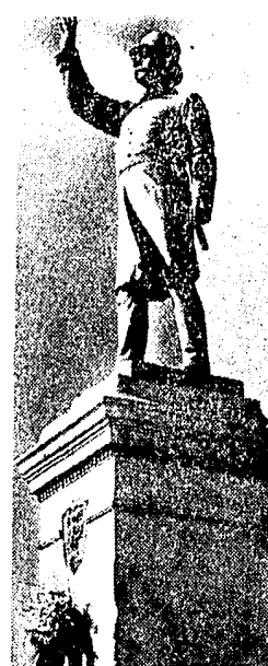
Haymarket statue commemorating the seven Chicago policemen who lost their lives in explosion of bomb in 1886.

The monument commemorates the explosion of a dynamite bomb May 4, 1886, which resulted in the deaths of 7 members of a 180-member police detachment and the wounding of 76 others. The explosion occurred while the detachment confronted an estimated 1,000 persons attending a meeting in Haymarket square. Many of the persons were workers on strike against the McCormick Reaper company. The explosion occurred after police ordered the meeting dispersed following a brief scuffle between striking and nonstriking workers.